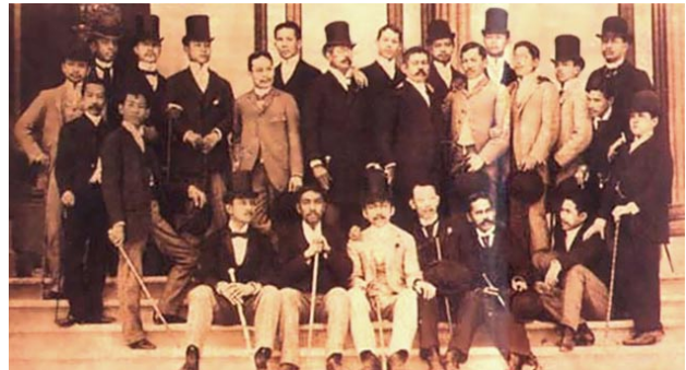
Figure 1. Ilustrados in Madrid. Rizal is in the second row, fifth from right. *The Life and Writings of Jose Rizal” http://joserizal.info/Biography/man_martyr/chapter04.htm

Internally, Spain was also in political turmoil, with the liberals fighting the conservatives, with civil wars, with governments and monarchs fighting coups d’etat,