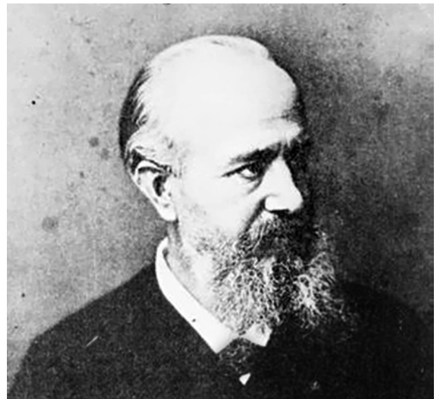
Figure 2. Dr. Louis de Wecker.

In the January to June 1886 edition of the Cincinnati Lancet Clinic , correspondence from Paris described de Wecker's cataract-surgery technique as a form of extracapsular cataract surgery using an ab-interno limbal incision similar to the Graefe technique using a Graefe knife that is still being manufactured today. He had his own style of capsulotomy using his forceps,